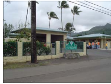
The Hauula Baseyard facility is completely paved, except for landscaping and gravel along the perimeter of the property. There are no storm drain inlets located within the baseyard. Storm water sheet flows towards the driveway and discharges to Hauula Homestead Road.