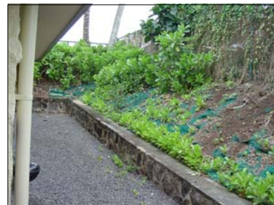
Landscaping and gravel surround the perimeter of the property.