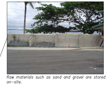
Raw materials such as sand and gravel are stored on-site.