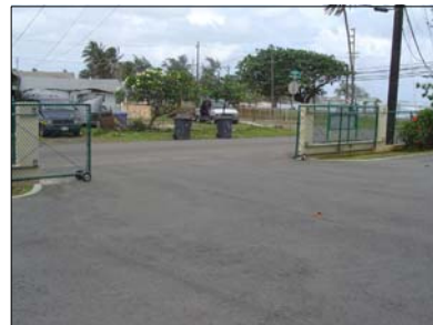
Storm water sheet flows in the northeasterly direction towards the driveway and discharges to Hauula Homestead Road. The nearest water body is the Pacific Ocean, which is approximately 60 feet north of the facility.