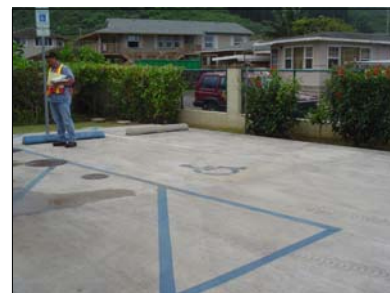
Washing of vehicles and equipment at the Hauula Baseyard is done on the concrete pavement area along the southern edge of the office building. Wash water flows westerly into the landscaped area along the western border of the site.