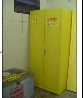
Chemicals are stored in cabinets under cover, in the garage/storage structure.