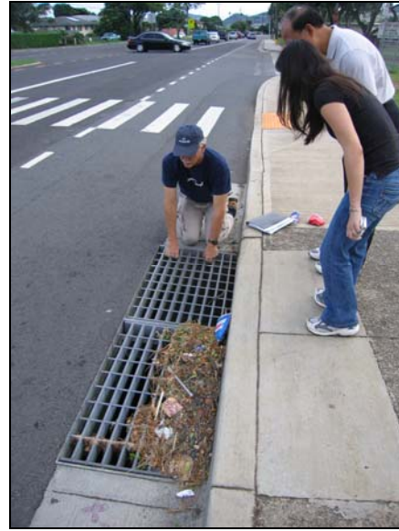
Debris accumulated along roadway curb and storm drain inlet

2. Erosion Control BMPs Program – HDOT Highways has completed an island-wide comprehensive assessment of erosional areas. The assessment identified eroded areas within HDOT rights-of-way that are in need of permanent erosion control. HDOT's assessment effort focuses on identifying erosion areas that have potential water quality impacts. These include areas that show evidence of rilling, gulying, or areas that potentially have significant sediment transport. Through prioritization and cost effectiveness analyses, HDOT will implement to the extent possible the installation of permanent erosion control measures. Two areas within Kawa Stream Watershed have been identified. These are: