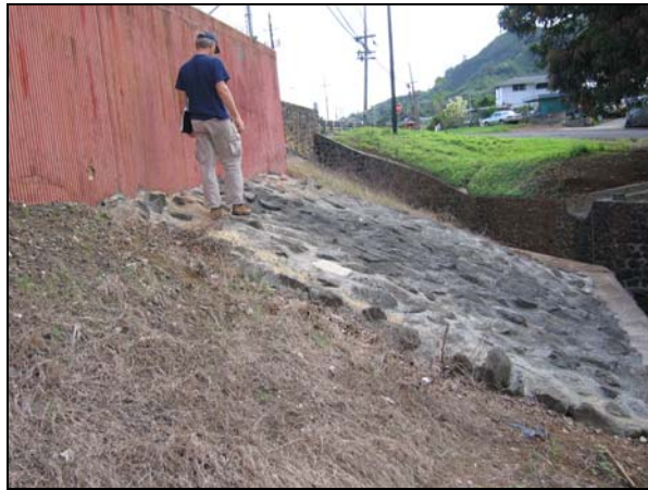
Potential structural BMP & monitoring location