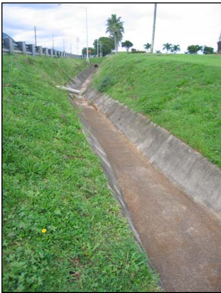
Potential conversion to grassed swale