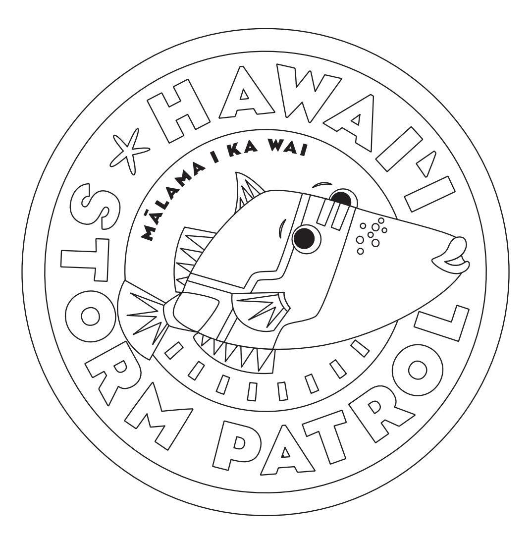
"Mālama I Ka Wai" Protect Our Water!