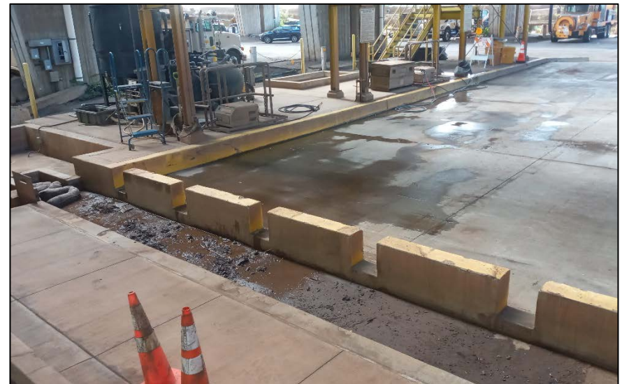
Proposed Trench Drain with Filter Location