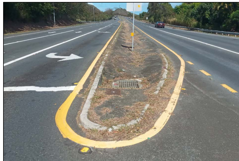
Proposed Bioretention Swale Location