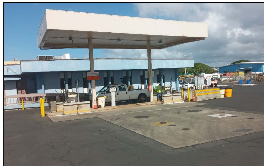
Proposed Trench Drain with Filter Location