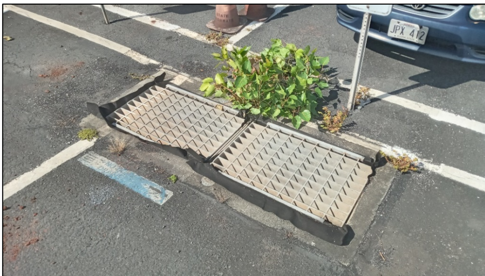
Proposed Grated Inlet Filter Basket Location