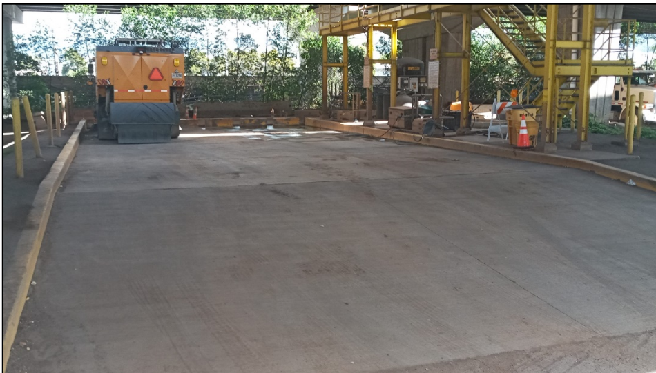
Proposed Trench Drain with Filter Location