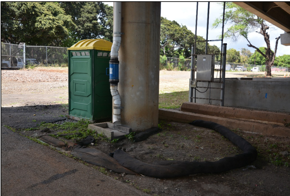
Proposed Downspout Filter Box Location