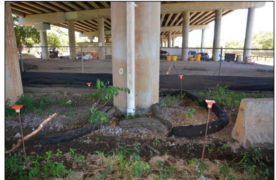
Proposed Downspout Filter Box Location