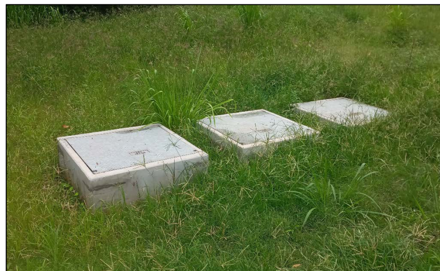
Nutrient Separating Baffle Box Access Hatches