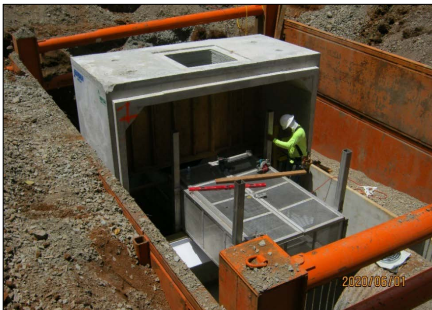
Nutrient Separating Baffle Box during Construction