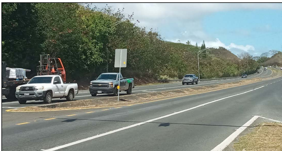
Proposed Bioretention Swale Location