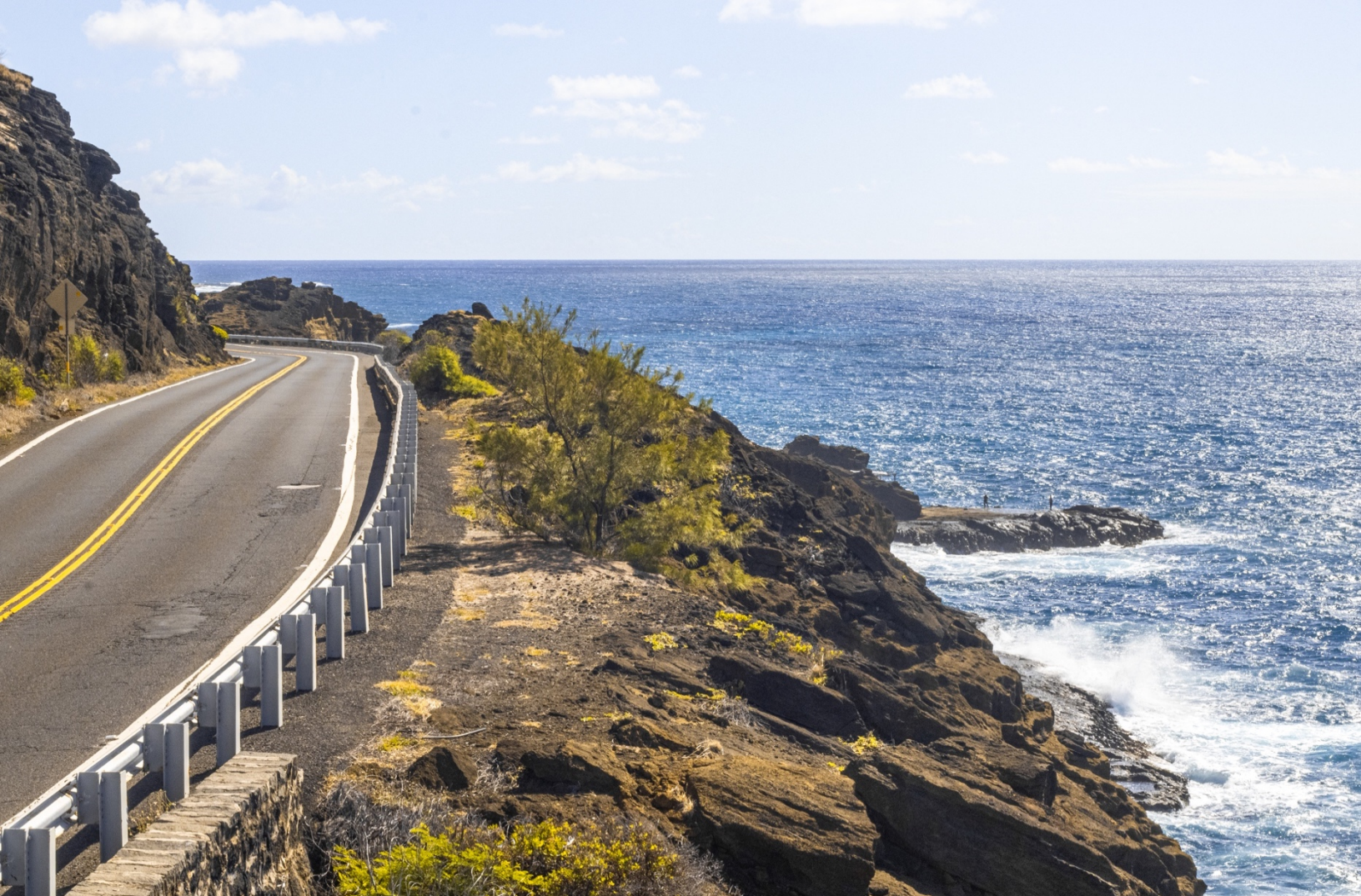
DOT-HWYS maintains Kalanianaʻole Highway along of eastern coast of Oahu.

The Reporting Program is designed to document SWMP activities and demonstrate compliance with conditions of the MS4 NPDES Permit and commitments set forth in the SWMPP .