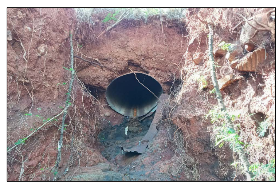
Erosion at outfall