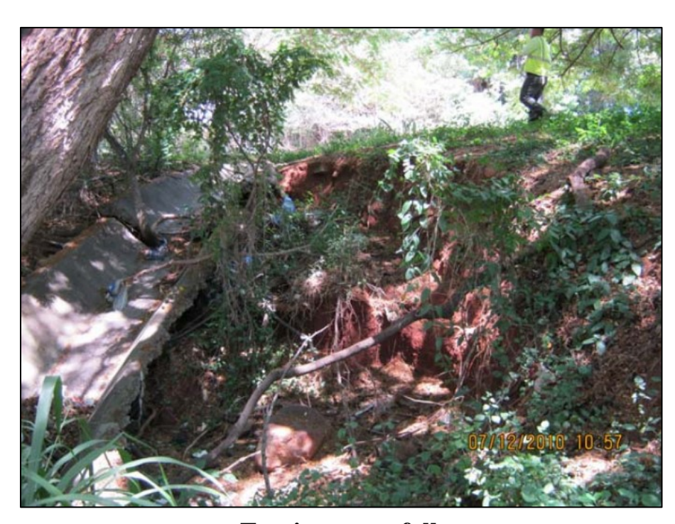
Erosion at outfall

Repair eroded areas and replace concrete channel and outfall.