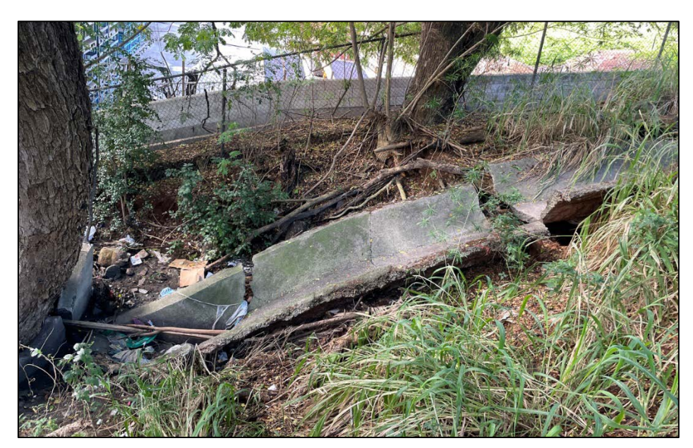
Failing concrete liner at outfall