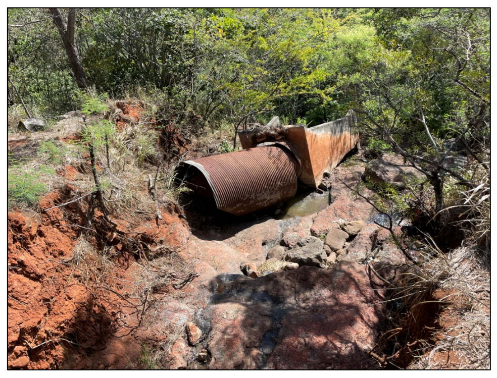
Failed concrete outlet structure downstream of outfall

New concrete outlet structure and outfall stabilization.