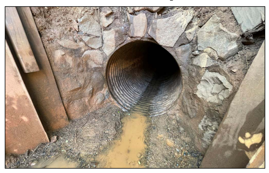
Outfall after removing debris