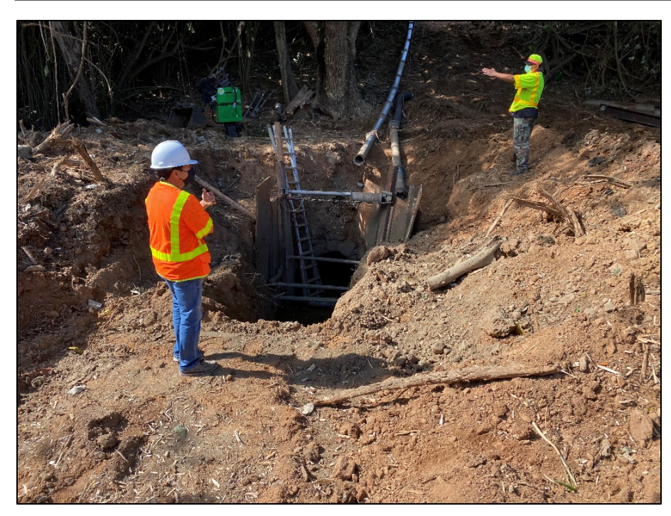
Sedimentation at outfall

Stabilize embankments. Elevate outlet to surrounding grade.