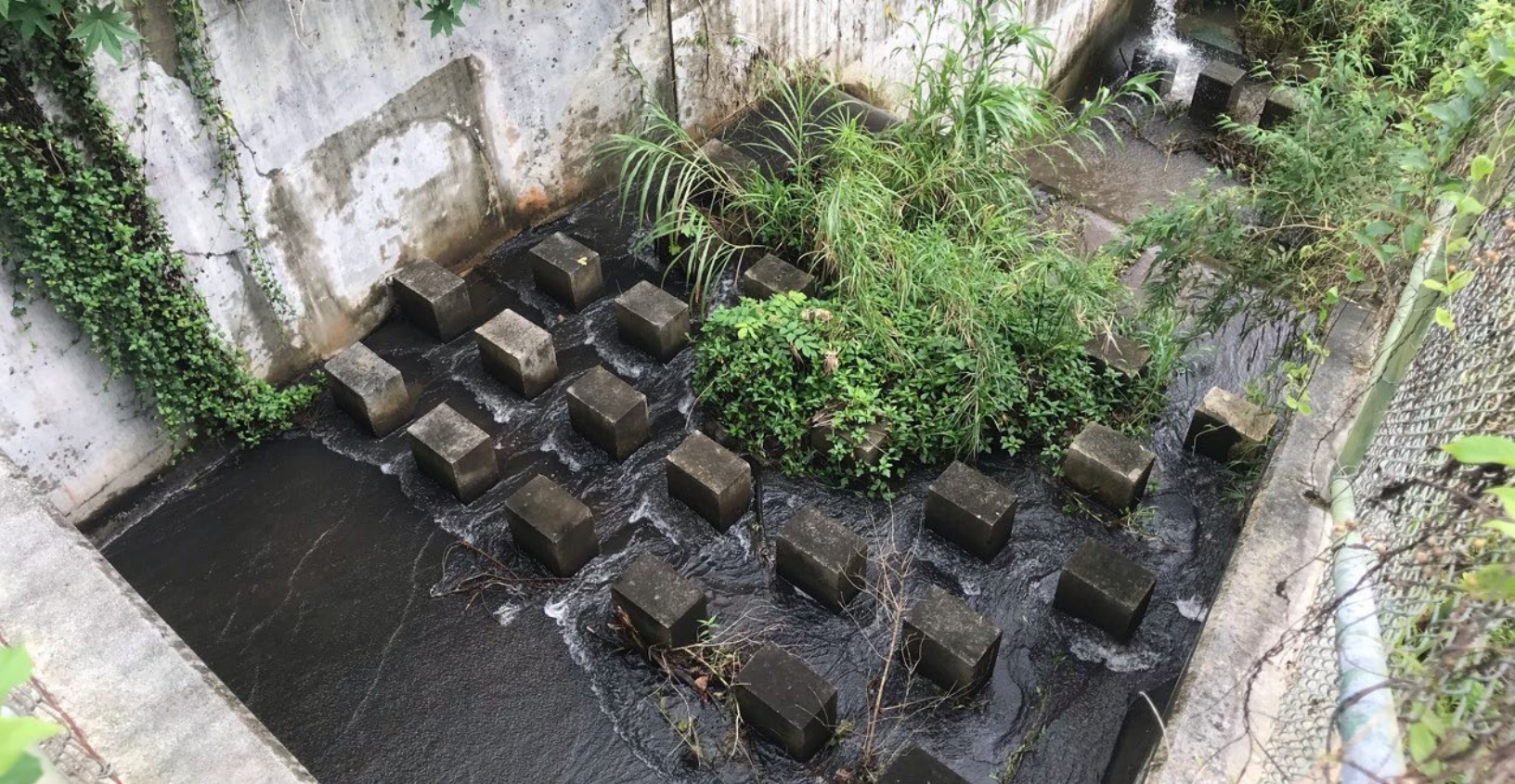
A drainage channel conveys storm water runoff on Pookela Street, Kaneohe, Hawaii.

The State of Hawaii, Department of Transportation, Highways Division, Oahu District (DOT-HWYS) owns and operates a municipal separate storm sewer system (MS4) on the Island of Oahu, Hawaii. The State of Hawaii, Department of Health (DOH) issued the MS4 National Pollutant Discharge Elimination System (NPDES) Permit No. HI S000001 (MS4 NPDES Permit) (Appendix A.1), that authorizes DOT-HWYS to discharge storm water runoff and certain non-storm water discharges from the MS4 and from five DOT-HWYS baseyard facilities into state waters in and around the island of Oahu. The MS4 NPDES Permit became effective on September 1, 2020, and will expire at midnight on August 31, 2025.